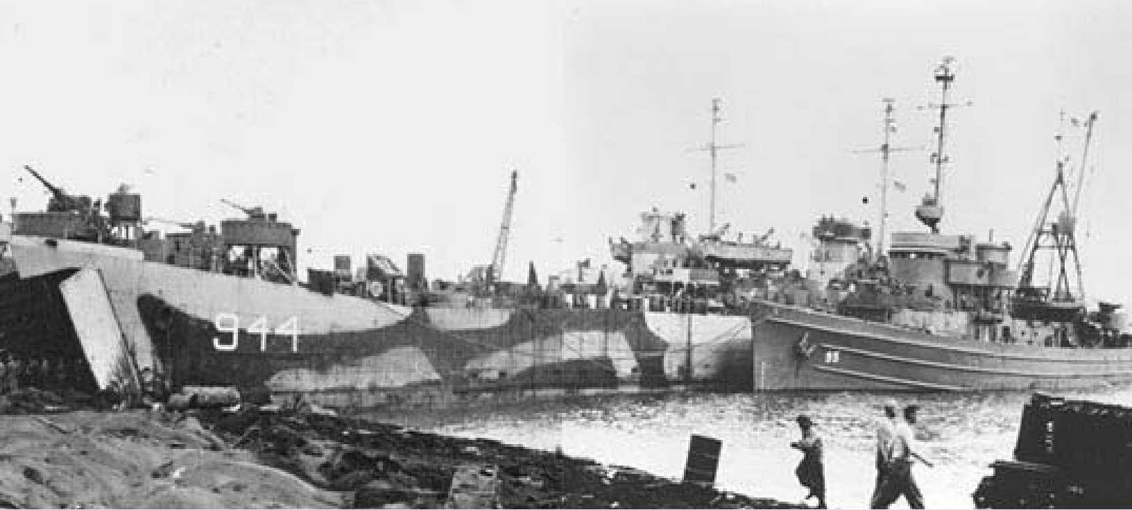
The USS Zuni assisting LST-944 at the beach on Iwo Jima.

She started as a 205-foot salvage tugboat that was one of 70 Navy ATF's, which stood for auxiliary tug fleet. Built at Commercial Iron Works in Portland, Oregon, she was christened the USS Zuni and launched on October 9, 1943. She was ATF-95. Hundreds of men—and one woman—would serve on her. In the Second World War, the Zuni saw the invasion of Tinian on June 24, 1944 and the occupation of Saipan. Following these missions, the Zuni rescued the cruiser USS Houston near Formosa (now Taiwan) after she was torpedoed. Shortly afterward, the Zuni towed the torpedoed cruiser USS Reno for eight days and 490 miles through waters laden with Japanese submarines after the Reno was hit off the San Bernardino Strait in the Philippines. During this rescue the Reno had to be lashed to the Zuni to keep the cruiser from capsizing.