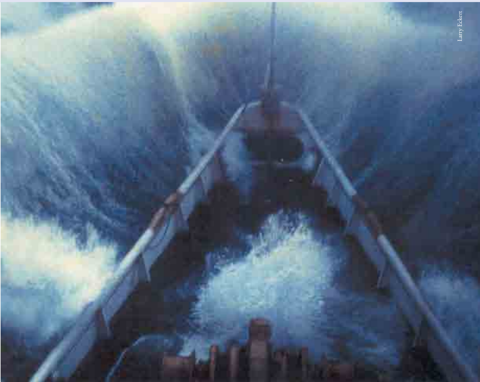
The Tamaroa battles hurricane force wind and waves.

officer at the time. We had a quartermaster (who piloted the ship) who was as old as dust when I came on board and never listened to the captain when he was at the helm and he was bringing the ship in, but he knew the tides and he was a good pilot.”